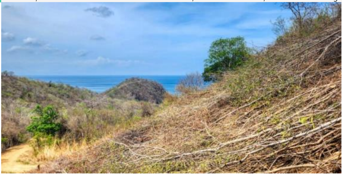
Lot 79, Your Dream Lot with Plans, Ocean View, Paradise Bay!

Oceanview dream lot with construction plans, Paradise Bay, San Juan del Sur. Imagine waking up to the whispers of monkeys and the symphony of birdsong, all while gazing out at the endless expanse of the Pacific Ocean. This incredible 1011 m2 lot nestled in the sought-after Paradise Bay development offers the perfect canvas for your dream home in San Juan del Sur.