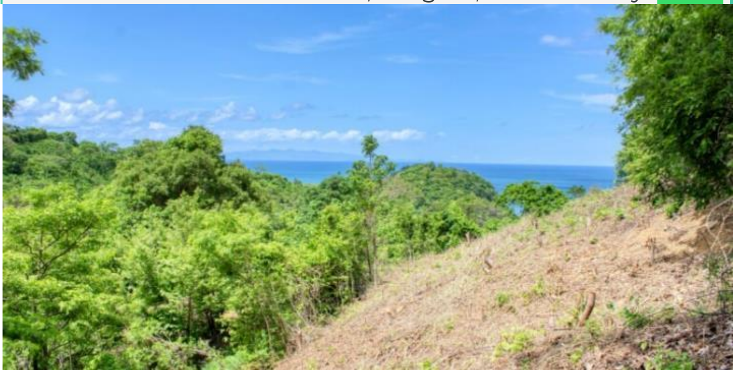
Lot 83 Dream Ocean view lot, bargain, Paradise Bay!

Lot 83 Dream Ocean View Lot, Bargain, Paradise Bay EXCLUSIVE