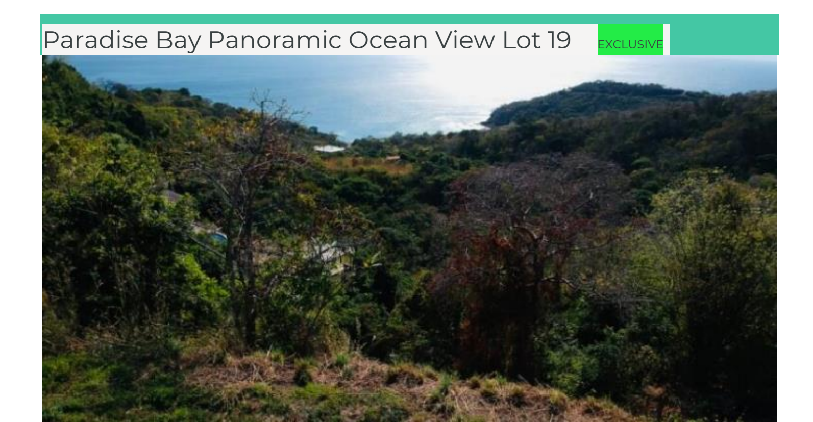
Paradise Bay Panoramic Ocean View Lot 19

Paradise Bay offers a unique blend of natural beauty and convenience, making it an ideal location for those seeking a luxurious living experience. Situated along the picturesque Pacific shoreline, residents are treated to breathtaking panoramic views that showcase the splendor of the surrounding landscape.