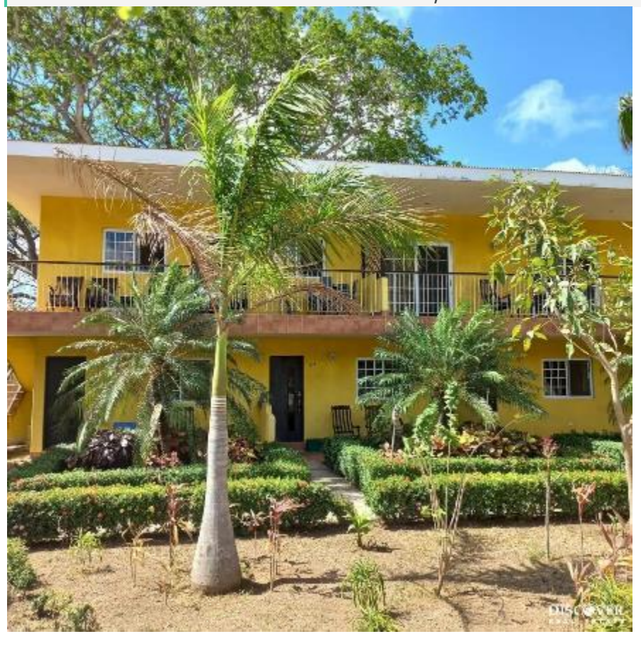
Condo 5.4 in Las Escadas, San Juan del Sur!

This is a 2 bed 1 bath condo on the second floor. Las Escadas is a development at the entrance to San Juan del Sur , offering comfortable, open floor plan apartments and great amenities. Conveniently located just 2 km from the center of town, this is an ideal space for someone looking to escape the business of town, yet still be within proximity to all the amenities.