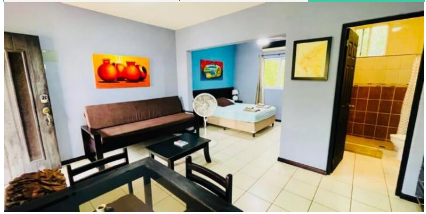
Condo 5.2 In Las Escadas, San Juan Del Sur!

This is Studio condo on the firts floor. Las Escadas is a development at the entrance to San Juan del Sur , offering comfortable, open floor plan apartments and great amenities. Conveniently located just 2 km from the center of town, this is an ideal space for someone looking to escape the busyness of town, yet still be within a close proximity to the amenities San Juan del Sur has to offer. This also gives the development's apartments great rental potential.