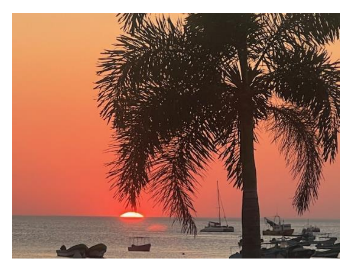
A very red sunset taken from Discover's front patio.

The cancer feels like it is finally shrinking again but I won't get another ultrasound until the end of next week. Here is my latest video update on it and what I'm doing: https://youtu.be/pYZH-vm9MkA