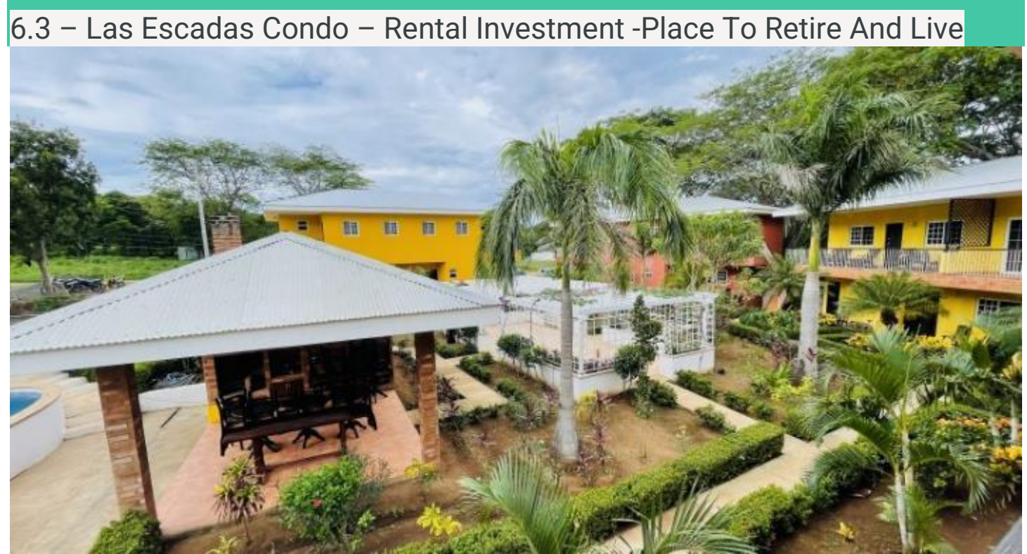
6.3 – Las Escadas Condo – Rental Investment -Place to Retire and Live in a very quiet neighborhood and close proximity to beautiful beaches of Maderas & Playa Hermosa, strategically located 5 min from the town of San Juan del Sur.

And right beside a Pickle Ball Complex under construction!!