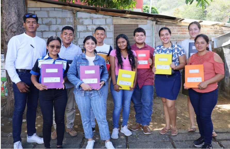
New FAJB students in 2022 (missing two students)

https://www.fundacionajbrugger.org/students-awaiting-sponsors.html