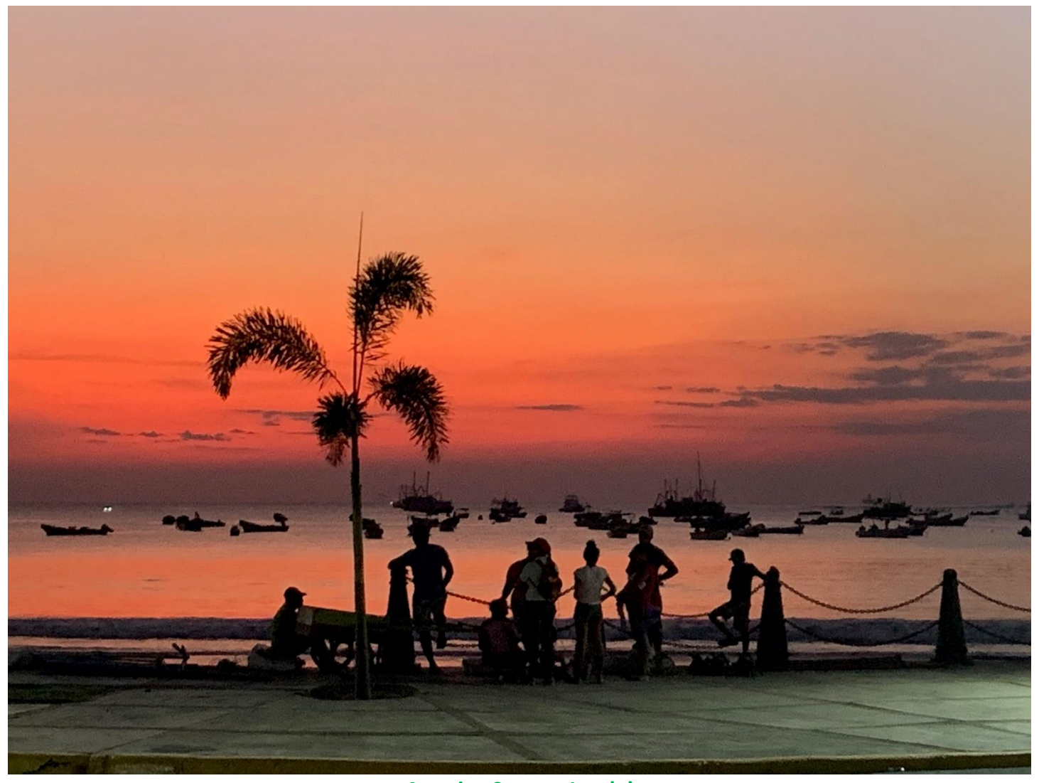
Amazing Sunsets Lately! From the patio of Discover Real Estate

New Format! Now in a PDF, let me know how you like it and hopefully more people will see it too!